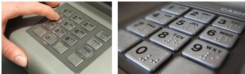
Fig1. Texture applied to ATM for blind person

• Another reason in choosing texture patterns for a product is given personality to it. Deciding on a texture pattern for a product can be carried out in a way that attributes the product to a particular group of people or reminds a specific lifestyle (Figure 2-4).